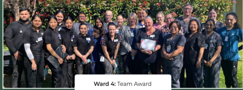
Ward 4: Team Award